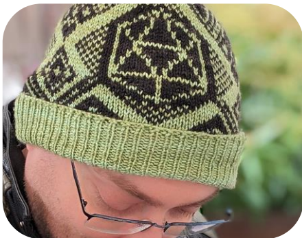
Big Dice Energy