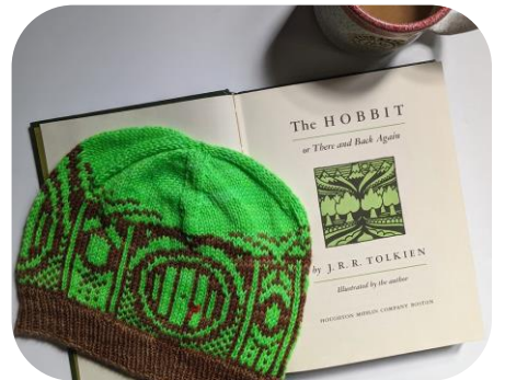
Just Shire Things