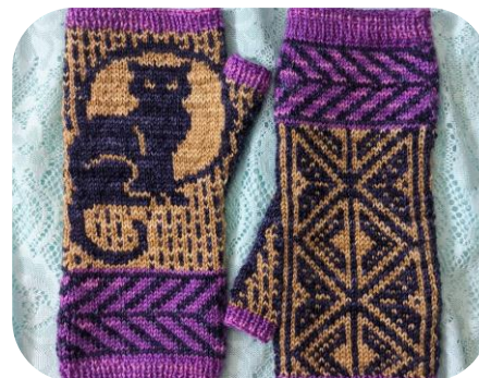
Cat Nouveau Mitts