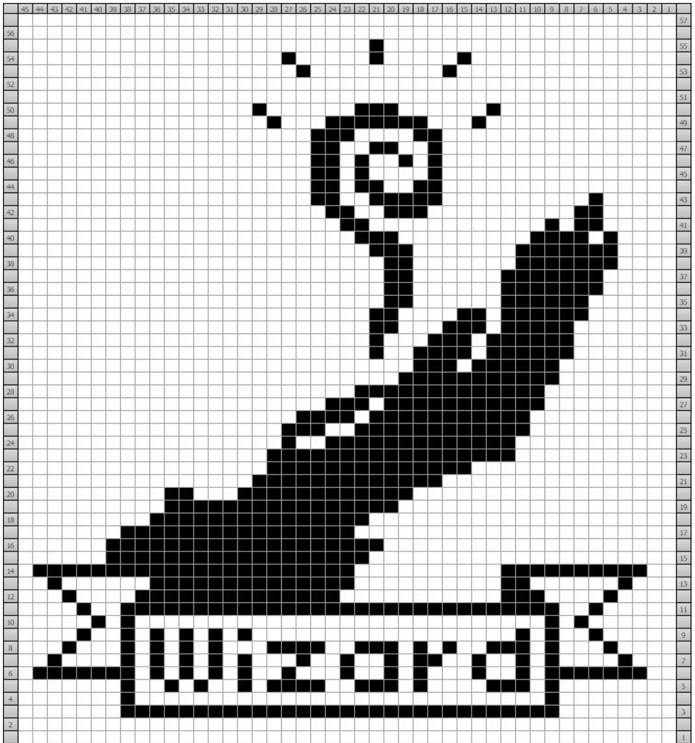
Chart B FOR CROCHET

If you enjoyed this free pattern, please consider donating to Child's Play Charity . You could help sick children in hospitals forget their troubles while reconnecting with their families through the power of play.