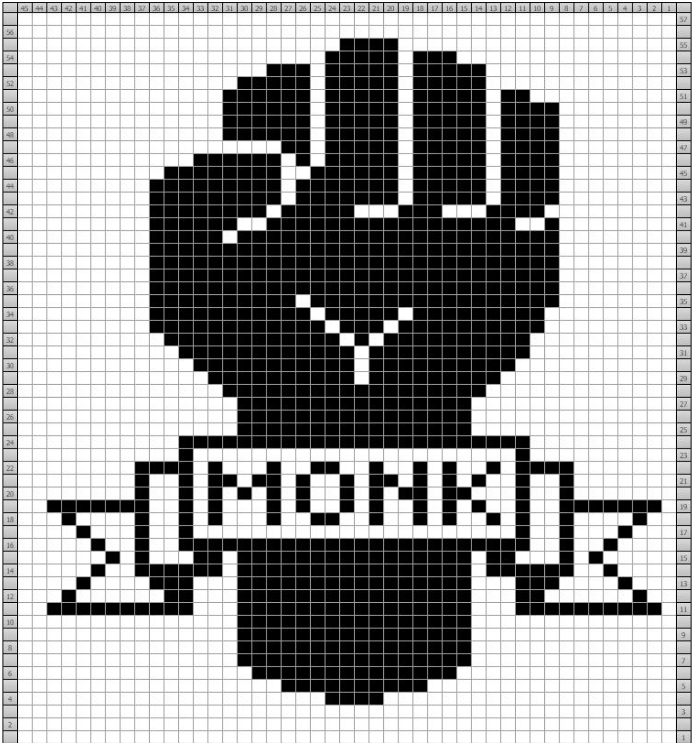
Chart B FOR CROCHET

If you enjoyed this free pattern, please consider donating to Child's Play Charity . You could help sick children in hospitals forget their troubles while reconnecting with their families through the power of play.