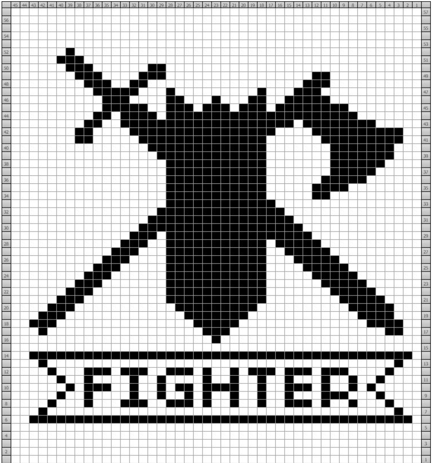
Chart B FOR CROCHET

If you enjoyed this free pattern, please consider donating to Child's Play Charity . You could help sick children in hospitals forget their troubles while reconnecting with their families through the power of play.