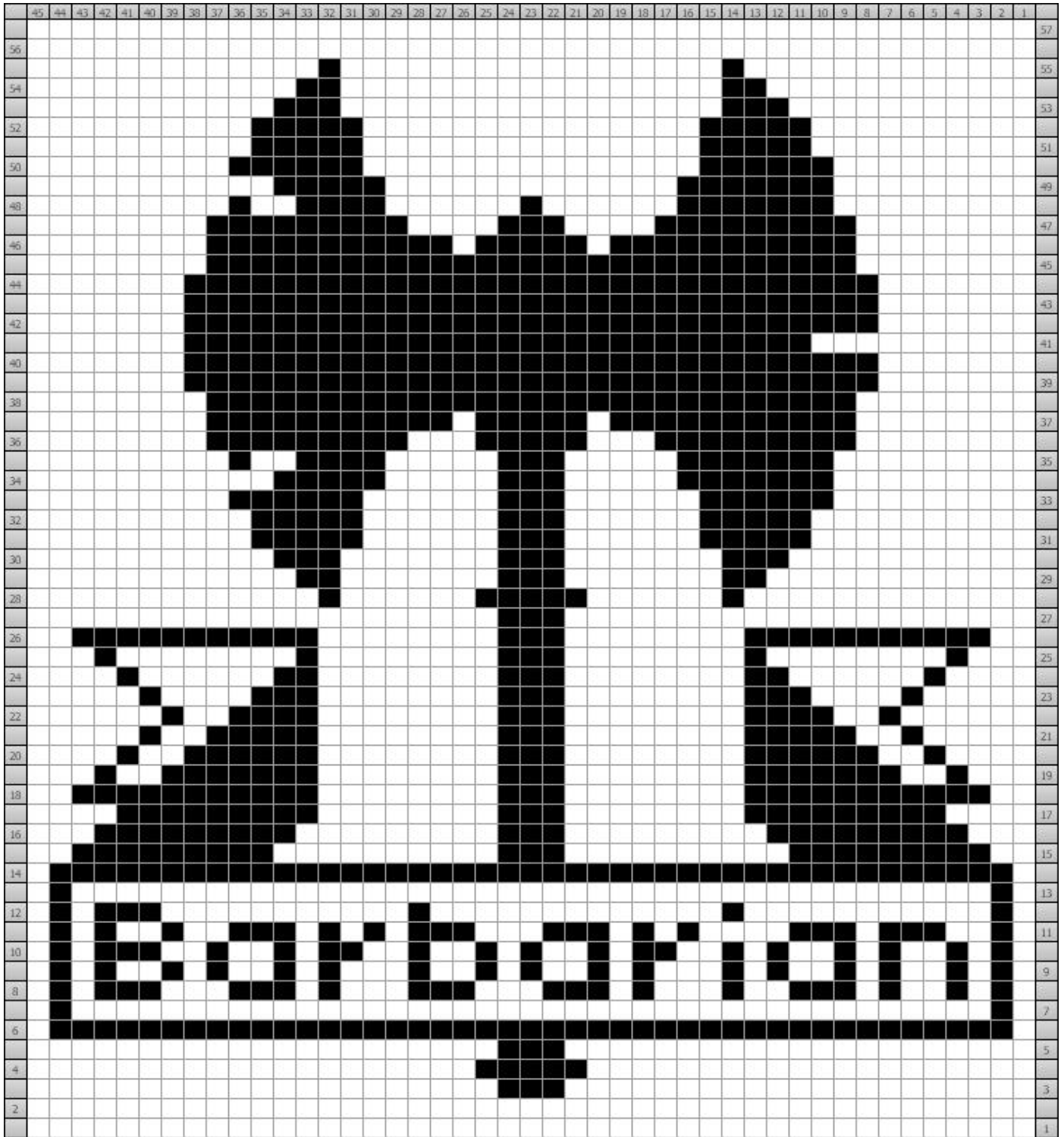
Chart B FOR CROCHET

If you enjoyed this free pattern, please consider donating to Child's Play Charity . You could help sick children in hospitals forget their troubles while reconnecting with their families through the power of play.