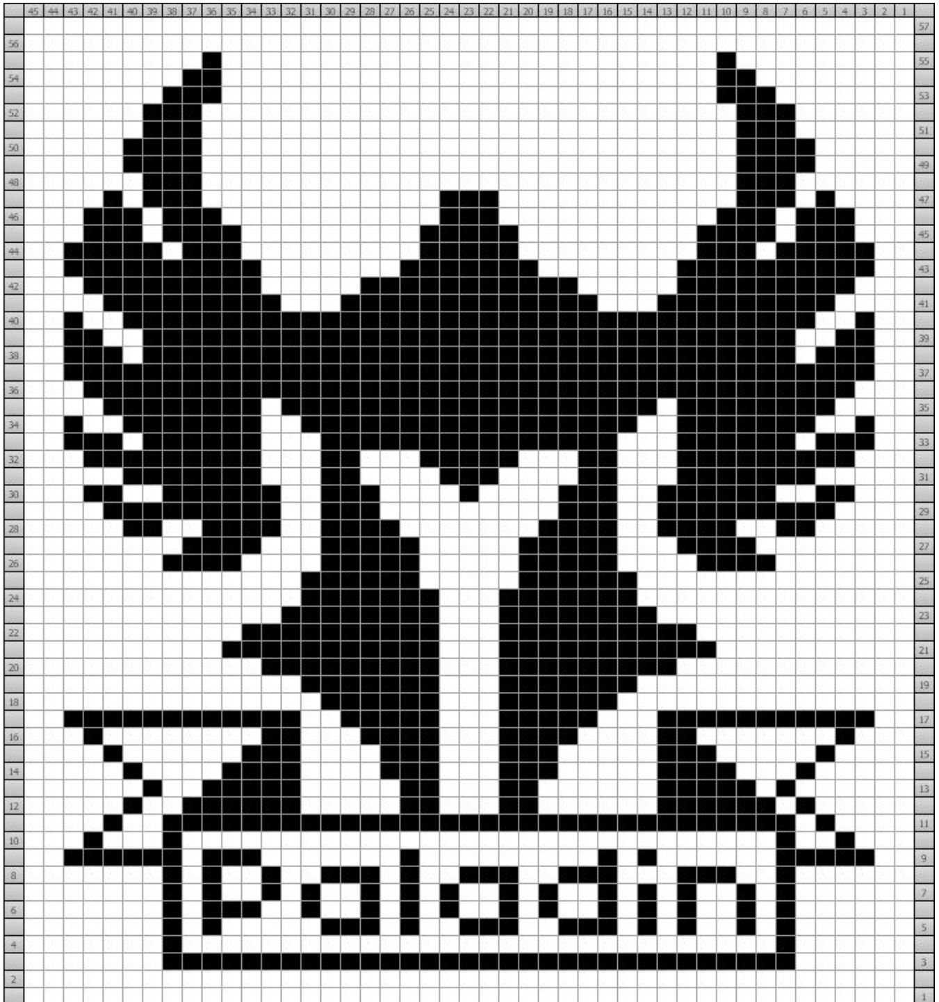
Chart B FOR CROCHET

If you enjoyed this free pattern, please consider donating to Child's Play Charity . You could help sick children in hospitals forget their troubles while reconnecting with their families through the power of play.