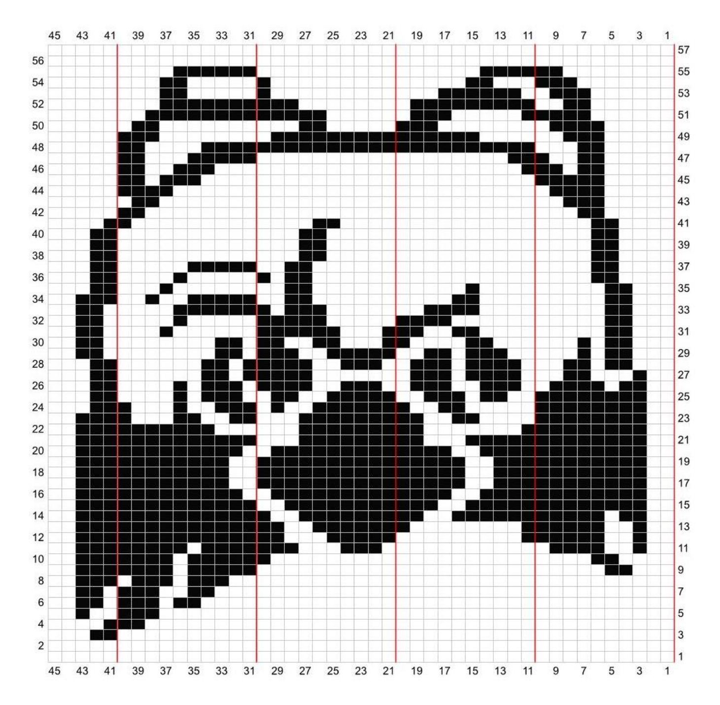
If you enjoyed this free pattern, please consider donating to <u>Child's Play Charity</u>. You could help sick children in hospitals forget their troubles while reconnecting with their families through the power of play.