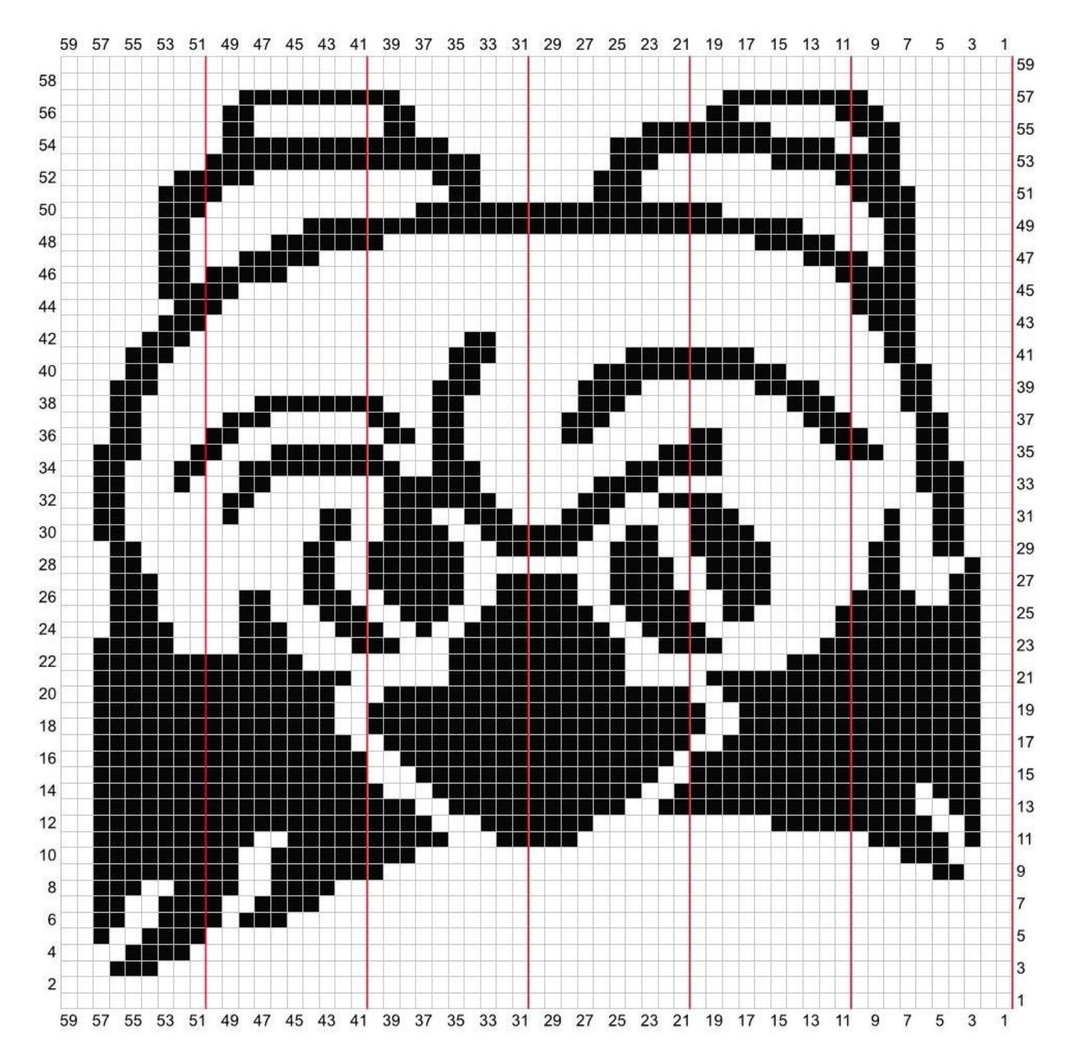
If you enjoyed this free pattern, please consider donating to <u>Child's Play Charity</u>. You could help sick children in hospitals forget their troubles while reconnecting with their families through the power of play.