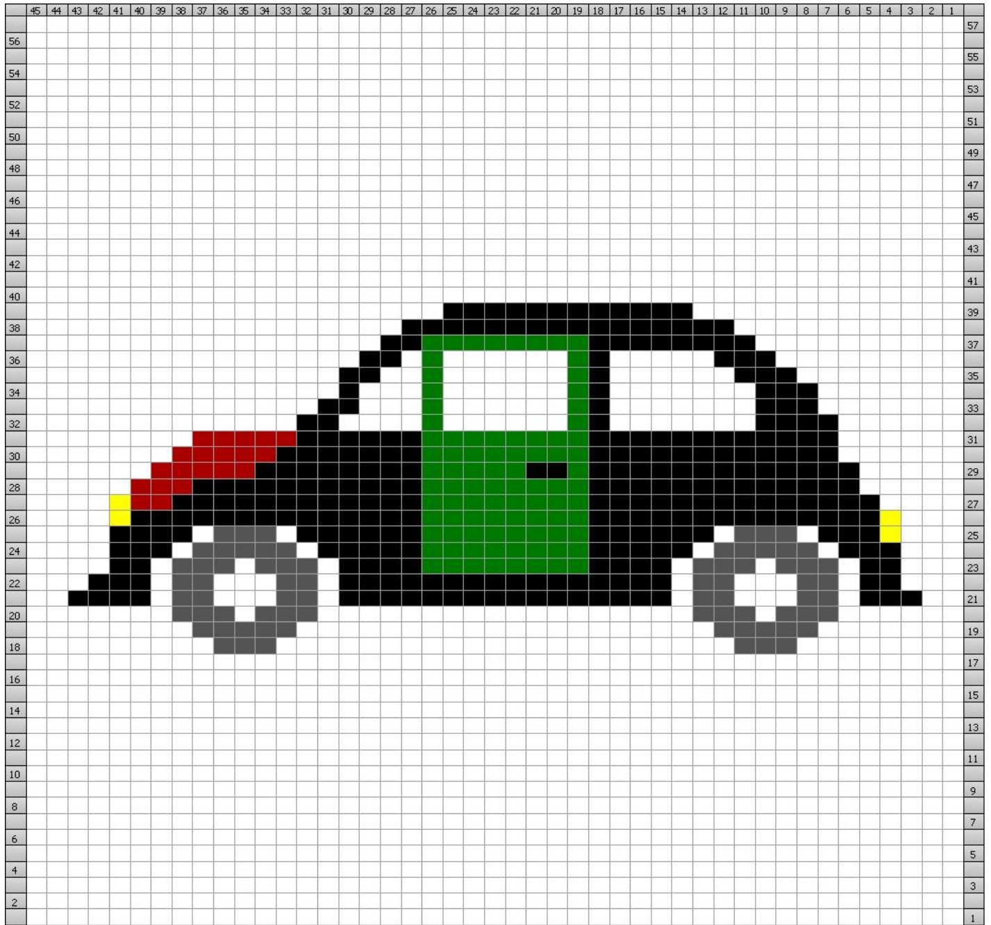
Chart A FOR KNITTING

If you enjoyed this free pattern, please consider donating to Child's Play Charity . You could help sick children in hospitals forget their troubles while reconnecting with their families through the power of play.