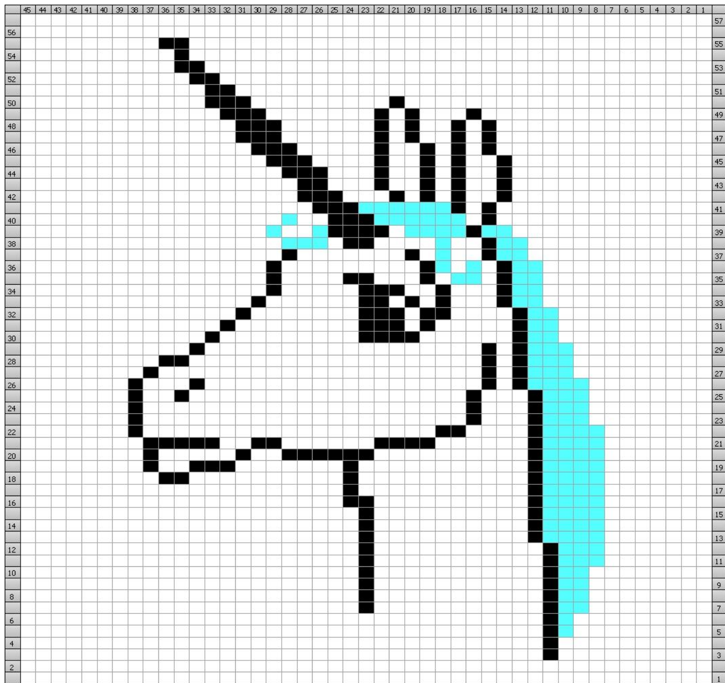
Chart A FOR KNITTING

If you enjoyed this free pattern, please consider donating to Child's Play Charity . You could help sick children in hospitals forget their troubles while reconnecting with their families through the power of play.