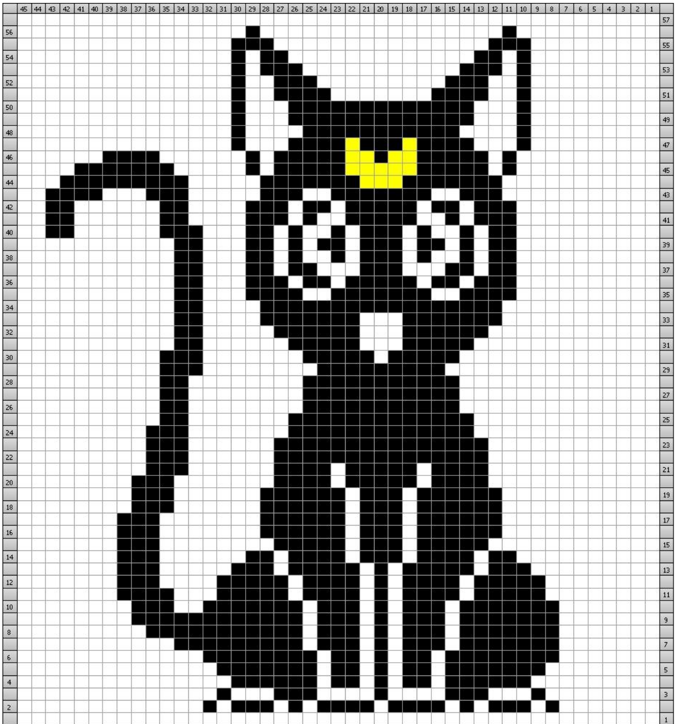
Chart B FOR CROCHET

If you enjoyed this free pattern, please consider donating to Child's Play Charity . You could help sick children in hospitals forget their troubles while reconnecting with their families through the power of play.