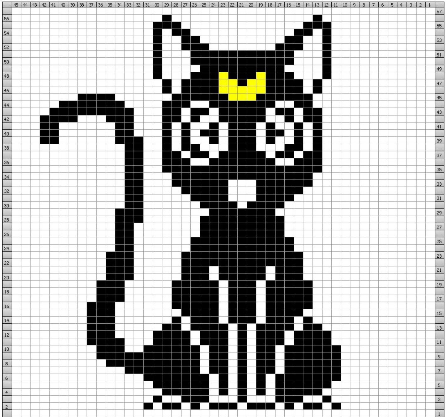
Chart A FOR KNITTING

If you enjoyed this free pattern, please consider donating to Child's Play Charity . You could help sick children in hospitals forget their troubles while reconnecting with their families through the power of play.